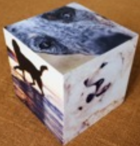
Souvenir Image Cube

*All digital images come on a custom USB and are optimized for both social media personal use